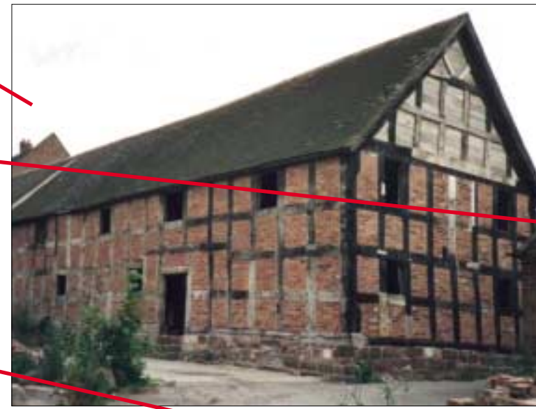
Below - the oldest part of High Ercoll Hall during renovation